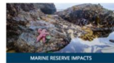
MARINE RESERVE IMPACTS