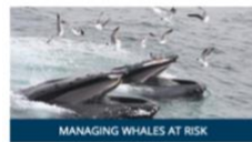
MANAGING WHALES AT RISK