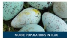
MURRE POPULATIONS IN FLUX