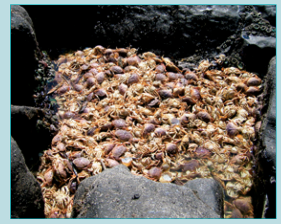
Dungeness crabs that washed up along the Oregon coast after succumbing to low-oxygen conditions.

For seven years in a row, a dead zone of low-oxygen water has formed in the Pacific Northwest, killing crabs, fishes, and other marine life. The size, duration, and severity of these dead zones have varied from year to year. The most severe event occurred in the summer of 2006 when oxygen levels dropped to historic lows and hypoxic water could be found in large areas along the Washington and Oregon coasts.