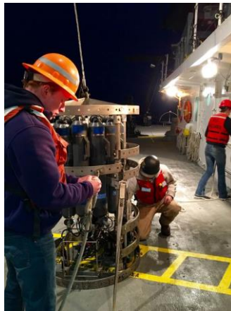
Coast high school students helped deploy the CTD from the R/V Oceanus

The next quarterly meeting of the Oregon Coast STEM Hub Steering Committee will take place in Newport on Tuesday, September 27, 2016 from 11am to 3pm. As always, Hub partners are welcome to attend. If you would like to participate, please contact us for more information.